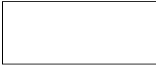
Diagram NOT accurately drawn