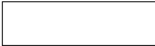
Diagram NOT accurately drawn