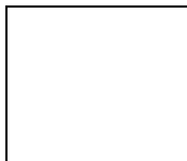
Diagram NOT accurately drawn