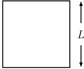
Diagram NOT accurately drawn